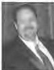
BRONC WISE Colorado