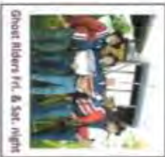
Ghost Riders Trif & Set night